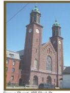
Corpus Christi, 152 Clark St.

Sunday, December 24th 9:00 am St. John Gualbert (Polish) 9:15 am Corpus Christi 10:15 am St. John Kanty 10:30 am St. Katharine Drexel NO 11:45 am at St. John Gualbert 12:00 pm St. Stanislaus (Polish)