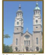
St. Stanislaus, 123 Townsend St.