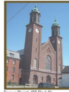
Corpus Christi, 152 Clark St.

Sunday, December 24th 9:00 am St. John Gualbert (Polish) 9:15 am Corpus Christi 10:15 am St. John Kanty 10:30 am St. Katharine Drexel NO 11:45 am at St. John Gualbert 12:00 pm St. Stanislaus (Polish)